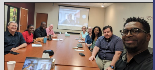
Members of ICM and FBC met to brainstorm how we may partner to expand the Kingdom globally.