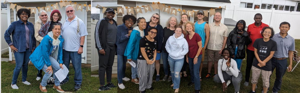
FBC students, family, & friends were able to gather to enjoy each other and celebrate Fall!

We at Faith Bible College have witnessed so many blessings! As 2023 closes, join us in honoring God through these blessings shared by our students and staff.